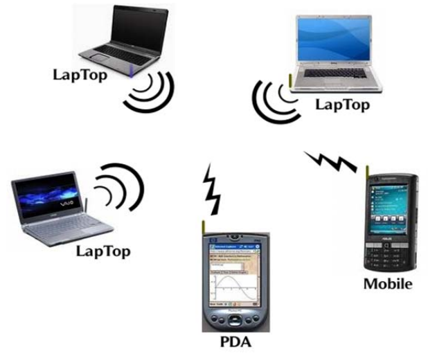
Figure 1.1 Mobile Ad Hoc Wireless Networks

As ad-hoc and sensor networks become a growing part of our everyday life, they could become a threat if security is not considered carefully before deployment. There are several security goals in ad-hoc networks. The provision of authentication is a core requirement for secure and trustworthy communication in ad-hoc networks, and it is the focus of this work. Only if there is efficient authentication available in ad-hoc networks, secure protocols and applications can be designed. IT security is the enabler for innovative applications, and provision of authentication is the enabler of security. The security issues for ad-hoc and sensor networks are different than the ones for fixed traditional networks such as local area networks (LANs) and wide area networks (WANs). Mobile ad hoc networks are different from mobile wireless IP networks in that there are no base stations, wireless switches, and infrastructure services like naming, routing, certificate authorities, etc. Because mobile nodes join and leave the network dynamically, sometimes even without a notice, and move dynamically, network topology and administrative domain membership can change rapidly. Thus it is important to provide security services such as availability, confidentiality, authentication [3, 4], access control, integrity, and non-repudiation.